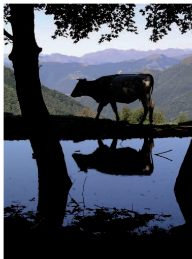
Bolla Palanzone

To continue the route, go back to the square and take the footpath on the left that goes uphill through the woods, ignoring the road signposted “Via alle Colme”. Bear right at each fork. The track ends up on the side of the small church S. Rita at the beginning of the Piazzale CAO square. Across Piazzale C.A.O. take the road to the left which leads past the mountain shelter Rifugio C.A.O. (980 m). The trail continues through the woods and soon reaches BAITA CARLA (997m) .