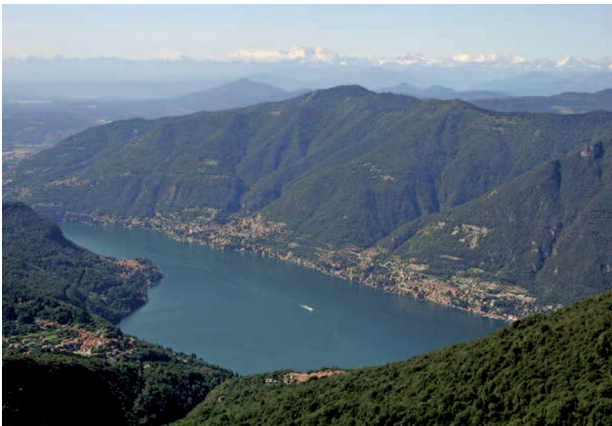
Vista dal Palanzone

Should you wish to interrupt the walk follow the asphalted road to the left downhill heading to PIAN DEL TIVANO (973 m- time 0.40; 6.00 hrs) - meals and lodging available - bus stop for the C32 line COMO – NESSO – PIAN DEL TIVANO. Tickets available at Ristorante Ministro.