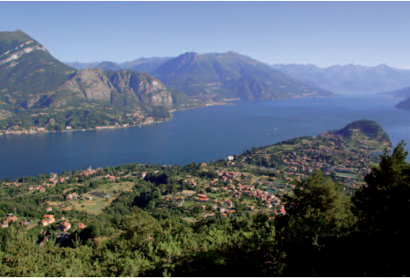
Vista su Bellagio

PIAN DEL TIVANO (957 m) - bus stop - lodging - meals - bus C32 Como - Nesso